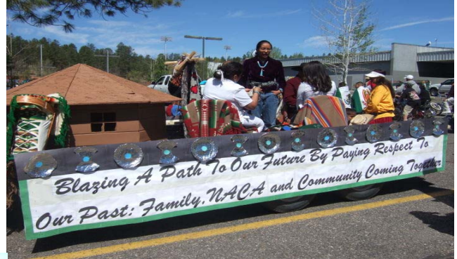
Top right- the finished float in the parade.