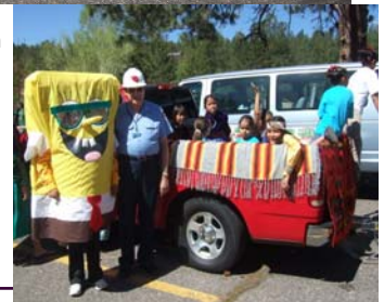
Right- The Pathways kids, the Mayor and Mr. Squarepants.